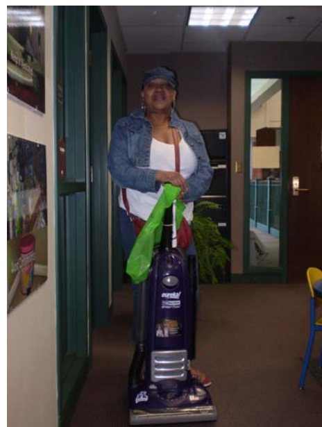
Above: Happy winner of the HEPA vacuum drawing