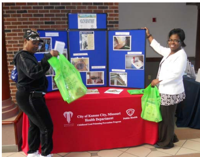
Above: Checking out the healthy homes education table